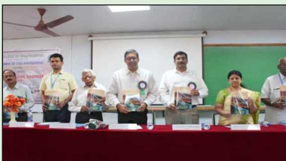
Proceedings of the Conference

community. Recent Trends in Civil Engineering (RTCE) was a National Conference for the presentation of new advances and research results in the field of Civil Engineering. Industrial experts, academicians and students from various engineering colleges participated in the conference and presented their ideas.