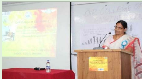
Speaker on International Women's Day