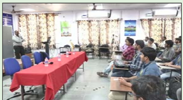
Participants in the Lecture