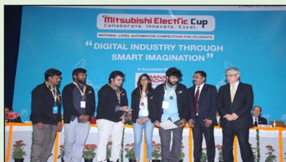
4th Appreciation Award in National Level Automation Competition

MeDURA "IoT Based GOT assisted Hybrid Drug Dispensing System for Rural Landscape" was judged by an eminent panel of seven judges (CEO's and R&D Heads of different companies) from both India and abroad. It was well appreciated as an innovative idea.