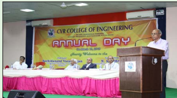
The Chief Guest Speaks to the College