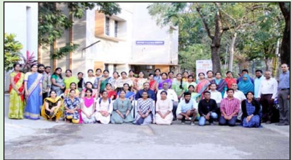
Leadership Workshop at OU