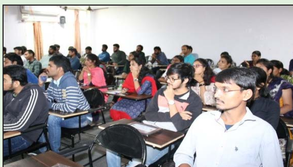
CSE Alumni Meet