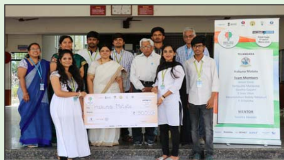
Hakuna Matata Team Wins Prize Money Rs.50,000 in SIH-2019