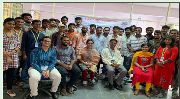
Participants at the Workshop