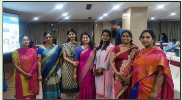
WIE Executive Committee 2019