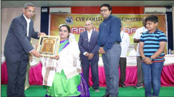
Faculty Members Felicitated for Their Services