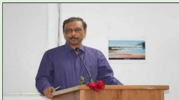
Subject Expert at Colloquium