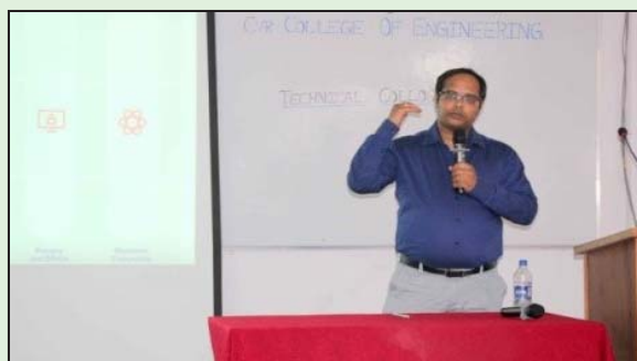
Speaker at Technical Colloquium