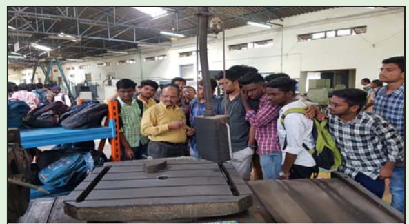
Students in Training Program