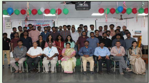
ECE Alumni Along with Principal & Staff

51 alumni attended the meet. Few of the alumni shared their experiences and recollected interesting moments of campus life to the audience. Many alumni opined that the key reason for their success was the platform provided by the institution. Furthermore, the alumni assured all kinds of support and cooperation for the betterment of the students and the institution. They provided valuable feedback on improving the course curriculum. The event concluded with tree plantation, lunch and felicitation of the ECE Alumni.