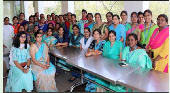
Women's Day Celebrations