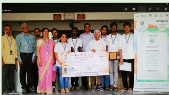
Eco Friends Team Wins Rs.1,00,000 Prize money in SIH-2019

The management of CVR College of Engineering, honored the winning teams with matching cash prizes amounting to a total cash award of 2 lakhs across all the winning teams.