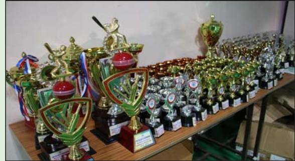
Awards Lined Up for Presentation