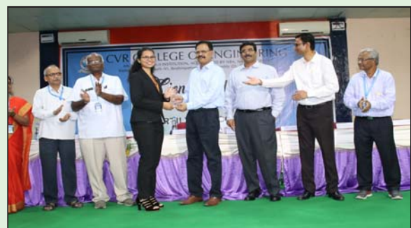
Winners Receiving Prizes