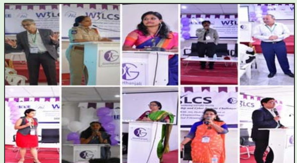
Workshop at Geethanjali College